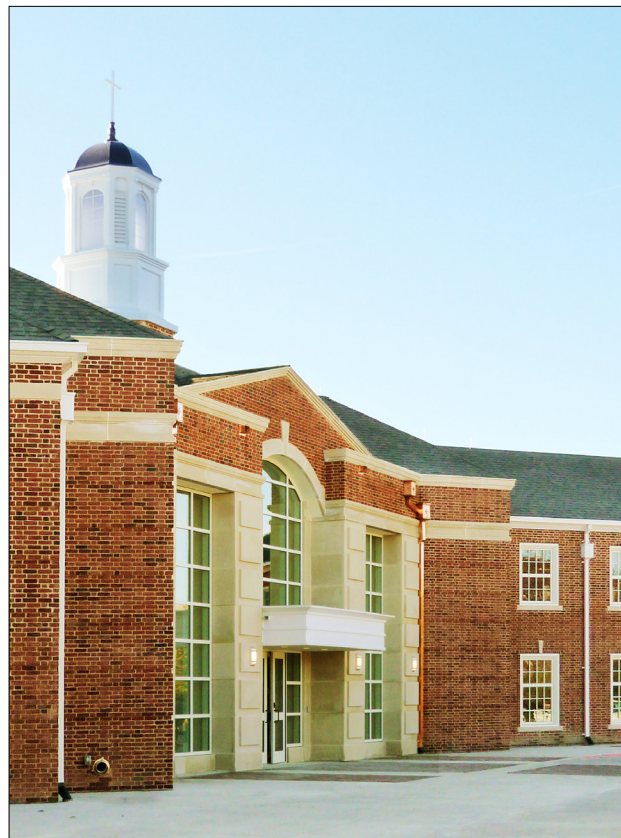
The new entrance was designed to stay true to the traditional style of architecture.

Sunday, Feb. 12, we will celebrate the opening of our newest sacred space! Everyone is invited to the Activity Center at noon for lunch, fellowship and a short service to consecrate the new building. Be sure to stay after the service to take a tour. To ensure an accurate headcount for lunch, sign up at the Connection Center or call the front desk at 214-368 1435. Donations to offset the cost of the lunch are accepted. To donate, go to www.upumc.org/give .