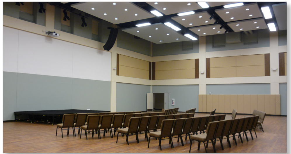
The Activity Center is spacious with 30-foot ceilings and seating for up to 500 people for a staged performance.

Several improvements to building accessibility were made early in the renovation process, and work to make the UPUMC campus accessible for all continues. One of the most desired features of the building plan has been elevator access from top to bottom – UPUMC has never had elevator access to the basement Youth Department. That is no longer the case as UPUMC's brand new elevator is up and running!