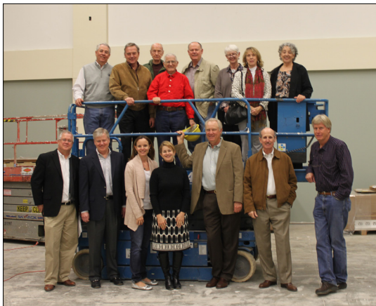
The UPUMC Building Committee

The spacious Activity Center takes up much of the new construction and will host a variety of functions in the coming life of the church. Its